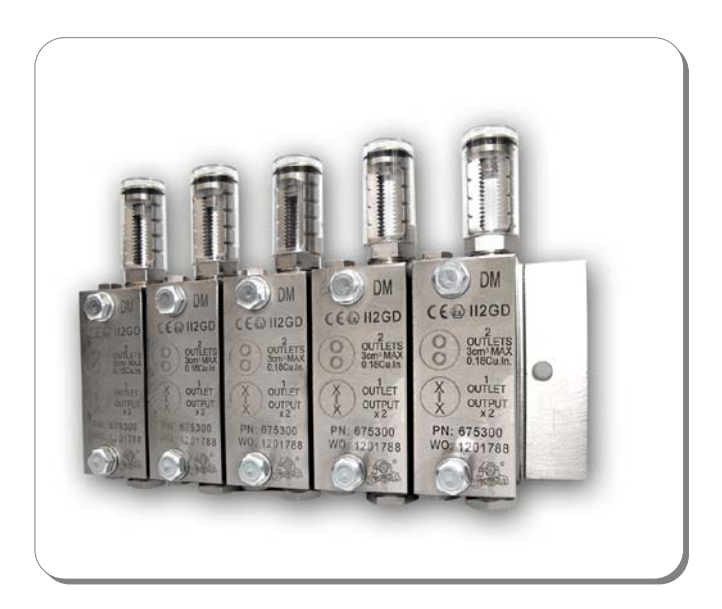
Dual line divider